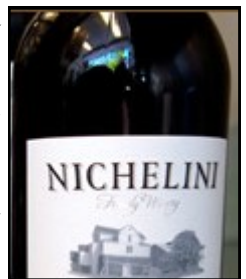
Nichelini wines will be served at the event noted above.