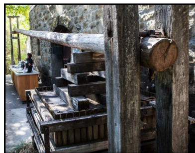
The Nichelini Winery is located at 2950 Sage Canyon Road, St. Helena. Established in 1890, it is the oldest winery in Napa Valley continuously owned and operated by the same family. The website is www.nicheliniwinery.com .

Fifty-four Napa Valley wineries opened for business on December 6, but few people came to buy. Prohibition and Great Depression it helped create destroyed most of what was once a vibrant industry. By 1962, there were only twenty-six wineries left, among them Nichelini, which is now the only surviving privately run winery in Napa County to have remained in business before, during and after Prohibition. (p. 131)