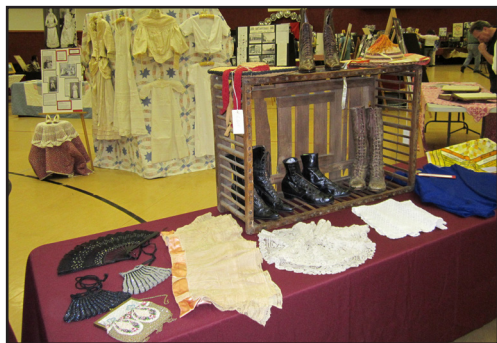
Museum For A Day display

Bonnie Thoreen, bthoreen@gmail.com, or call 707.963.7529